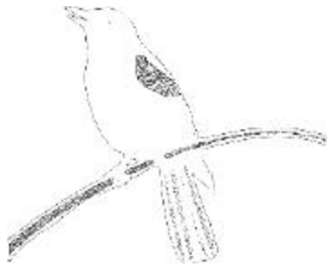
RED- WINGED BLACKBIRD

Now you have a bookmark with fun facts about the Las Vegas Wash. Use it to mark the place in your favorite book. To make it last longer, laminate it.