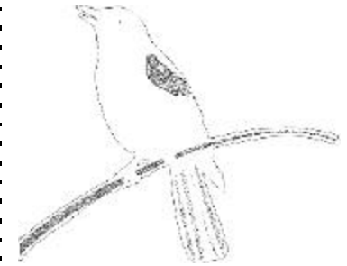
RED- WINGED BLACKBIRD

Now you have a bookmark with fun facts about the Las Vegas Wash. Use it to mark the place in your favorite book. To make it last longer, laminate it.